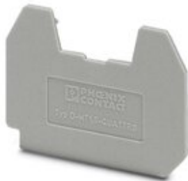
End cover, length: 33.6 mm, width: 1 mm, height: 24.3 mm, color: gray

Please be informed that the data shown in this PDF Document is generated from our Online Catalog. Please find the complete data in the user's documentation. Our General Terms of Use for Downloads are valid ( http://phoenixcontact.com/download )